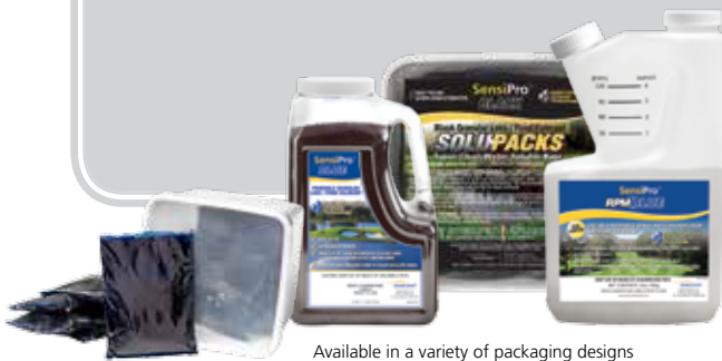
Available in a variety of packaging designs